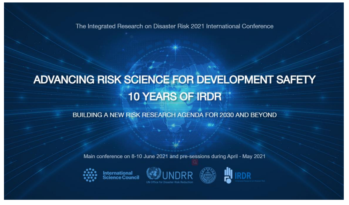
Figure 2 Post of the Conference