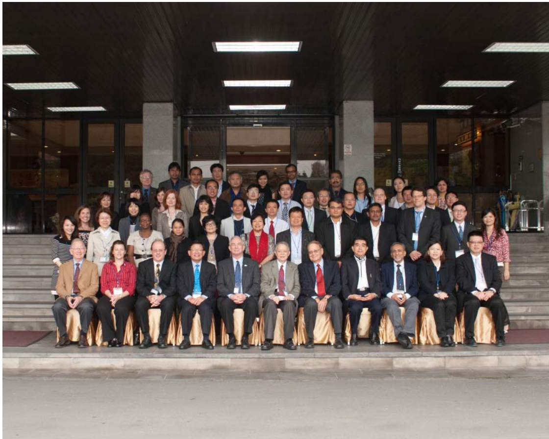
Group photo of CAR II in April, 2011

IRDR-ICoE successfully held the “Cities at Risk: Building Adaptive Capacities for Managing Climate Change Risks in Asian Coastal Cities (CAR II)” in Taipei during 11 th . -13 th . April 2011. Many scientists and researchers all over the world working on urban adaptation and risk were invited to participate in the Symposium. Issues related to Climate Change, Vulnerability and Adaptation were discussed in the meeting.