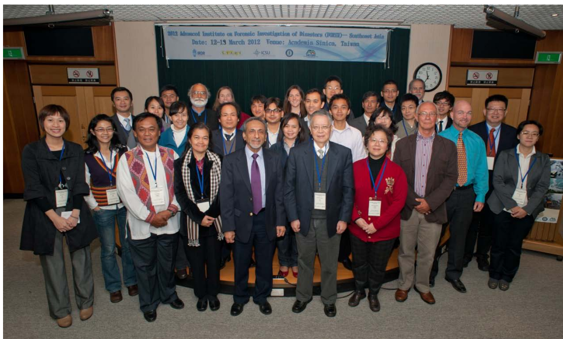
Group photo of AI FORIN in March, 2012

The 2012 Advanced Institute on FORIN brought together more than 50 participants attended the Institute including senior international and local scientists and approximately 30 young researchers in the Southeast Asia region. During the Advanced Institute, the young researchers can have the opportunities to know more about the enhanced understanding, skills and resources to design, organize and carry out FORIN related studies in their own countries. Institute sessions included educational modules, hands-on interactive exercises and field visits. As a condition of acceptance, all Institute participants are expected to conceptualize an individual or collaborative project, to be presented in plenary at the conclusion of the Institute, which may later be submitted for competitive funding to support follow-on activities