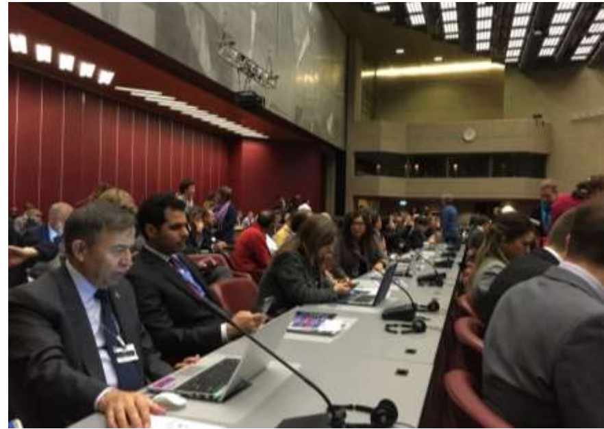
Photo: ISDR Science & Technology Conference, Geneva, January 2016 (Thomalla).