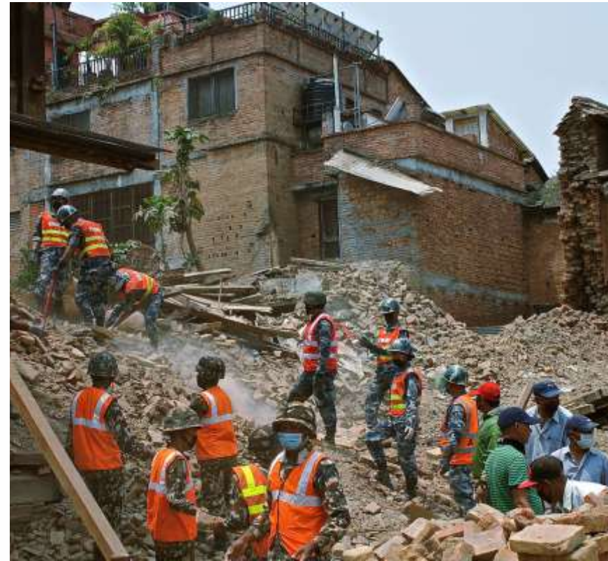
Crews search through the rubble after the Nepal earthquake in April 2015.