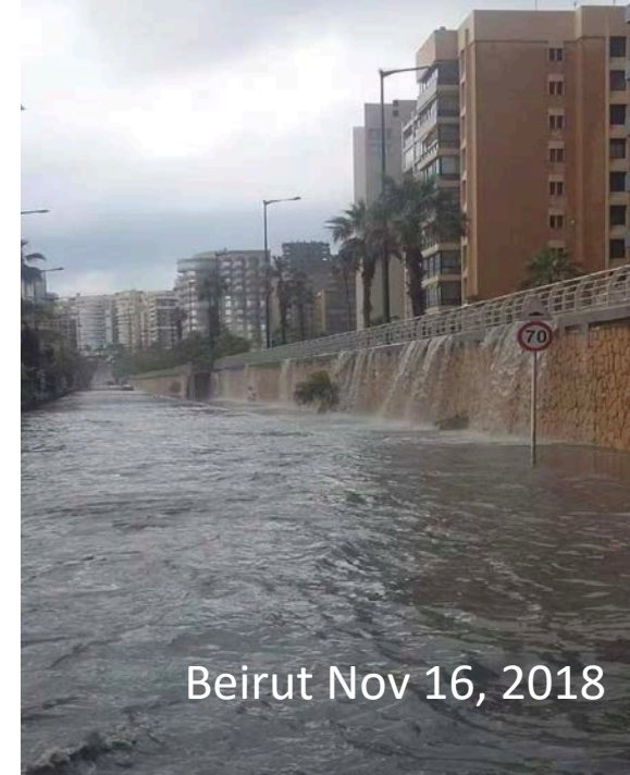
Beirut Nov 16, 2018