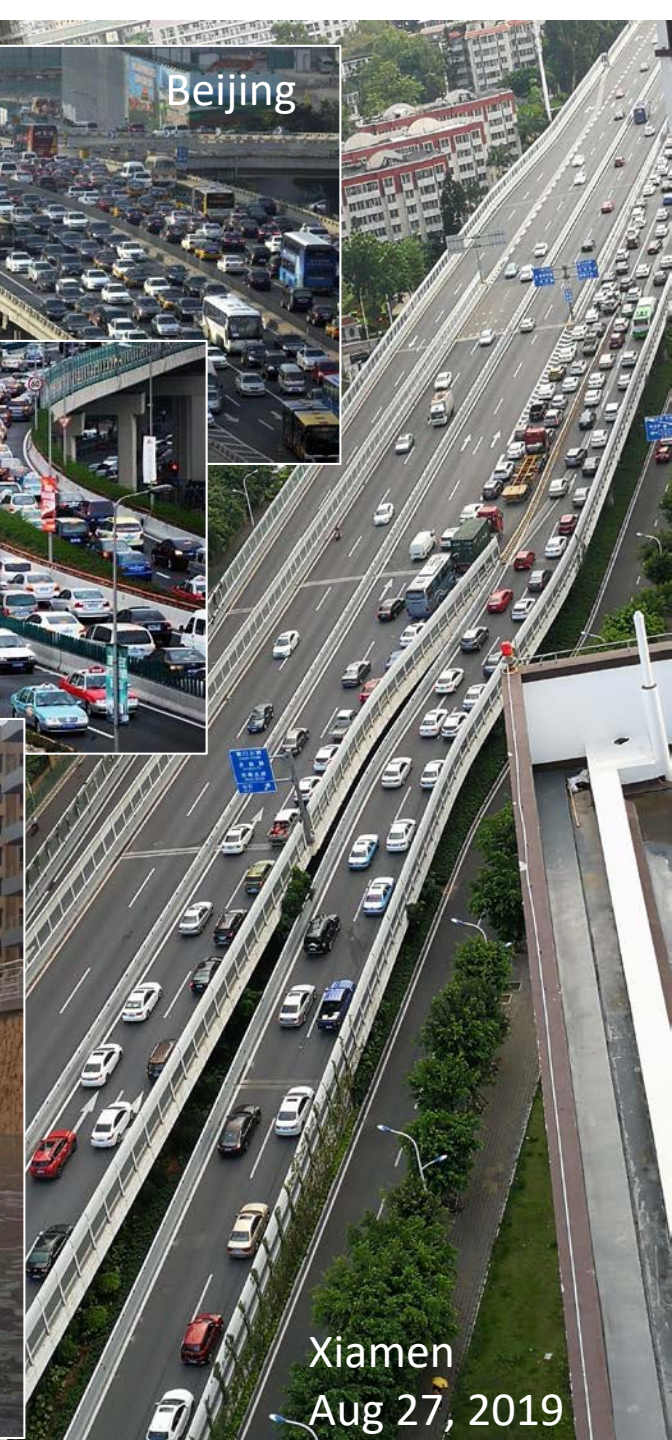
Xiamen Aug 27, 2019