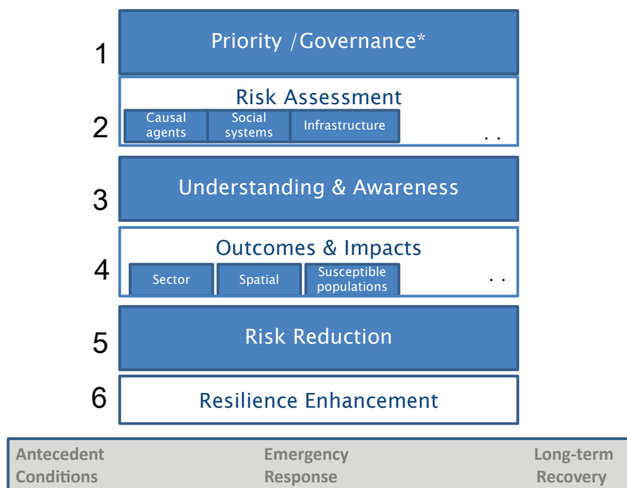
Figure 1. A conceptual framework for key questions.

This framework is intended as a guide to the development of FORIN investigations and the wider IRDR programme.